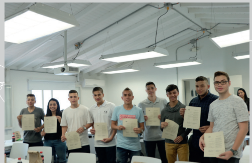
Students, EAFIT, Colombia