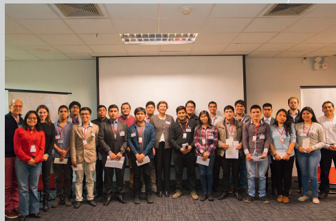
Compromiso de Honor, Perú