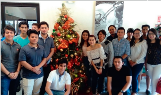
Meeting of scholars, end of 2017, El Salvador