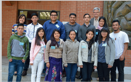
Scholars, UFM, Guatemala